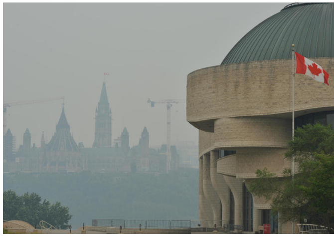
Ottawa, June 2023.

In the face of climate change, the tourism industry must adapt and confront its effects. Summer tourism having already suffered, fall tourism is also at risk. Adaptation, emissions reduction, and effective communication strategies are crucial for the industry's recovery in the face of these challenges. For more information visit: https://globalnews.ca/news/9757273/wildfires-tourism-impact-canada/