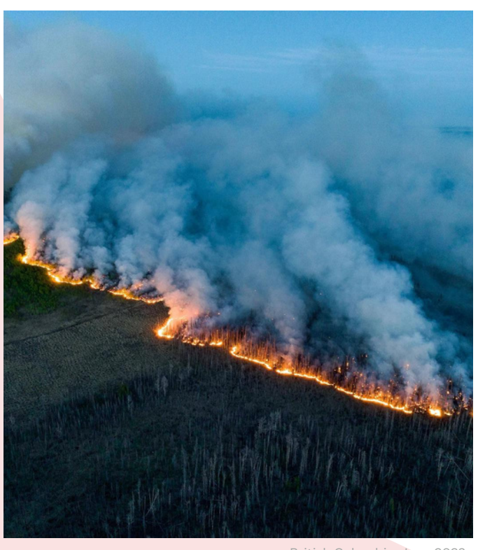
British Columbia, June 2023.

Canada's travel and tourism sector was expected to fully recover from the pandemic this year, but the country's Minister of Emergency Preparedness warned that 2023 could become the worst year on record for wildfires. Currently, there are more than 1,000 active fires across the country, with over 43,000 square kilometers burned this year. The fires have also affected other provinces, such as Nova Scotia and Quebec, where larger-than-usual fires have resulted in evacuations and the closure of outdoor activities in various regions.