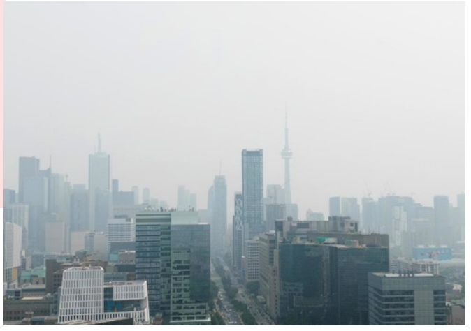
Toronto, Ontario, June 2023